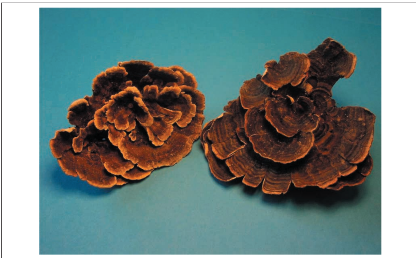
Figure 1. Dried Coriolus versicolor mushrooms.

cytotoxic activity of splenocytes and T-killer cells isolated from tumor-implanted mice. 12,15